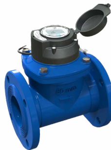
E-Register + Turbo-Bar Meter