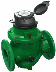
E-Register + 900 Meter

All existing BERMAD water meters with mechanical magnetic registers can be upgraded to the Electronic Register