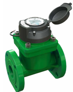
E-Register + Turbo-IR Meter