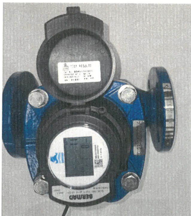
Figure 2: Sealing 1 - of the water meter Turbo Bar E